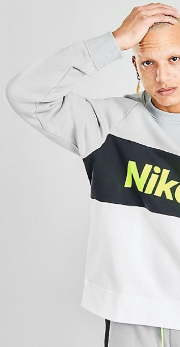
Marrs Height 5'9" | 175cm Suit 40" | 102cm R Shirt 34" | 86cm Waist 30" | 76cm Inseam 30" | 76cm Shoe 10 US | 44 EU Hair Blonde Eyes Brown