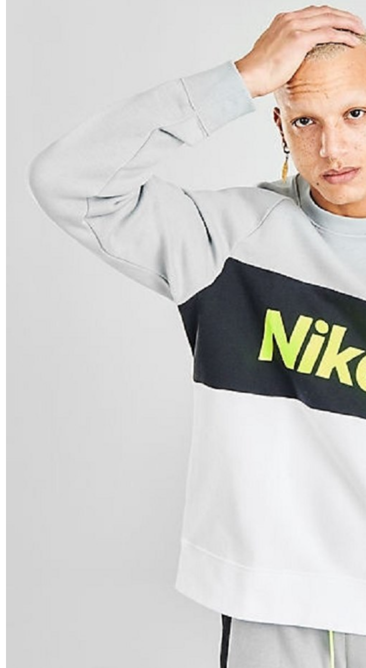
Marrs Height 5'9" | 175cm Suit 40" | 102cm R Shirt 34" | 86cm Waist 30" | 76cm Inseam 30" | 76cm Shoe 10 US | 44 EU Hair Blonde Eyes Brown