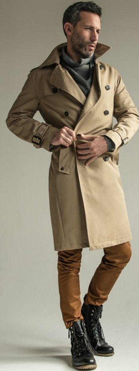
Raphael Hildebrand Height 6'1" | 185cm Suit 40" | 101cm R Shirt 34" | 86cm Waist 32" | 81cm Inseam 33" | 84cm Shoe 12 US | 46.5 EU Hair Salt and Pepper Eyes Hazel