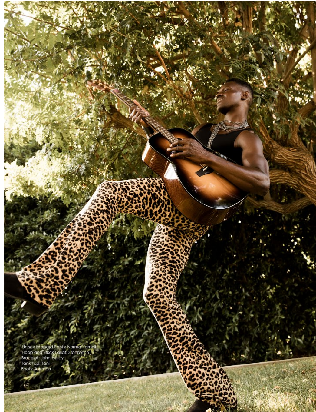
Unisex Leopard Pants: Norma Kamali Hoop and Stick Lariat: Stonbyton Bracelet: John Hardy Tank Top: Toni Boots: Toeman