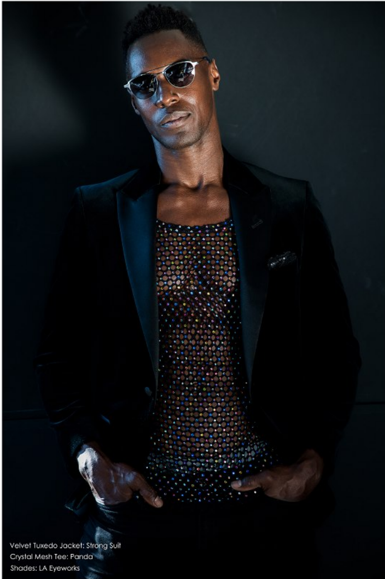
Velvet Tuxedo Jacket: Strong Suit Crystal Mesh Tee: Panda Shades: LA Eyeworks