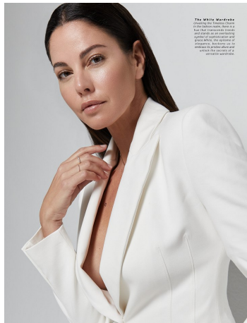
THE WHITE BLAZER DESIGNED BY TONYA TAYLOR FOR THE 2019 COLLECTION IS A PERFECT EXAMPLE OF CLASSIC, TIMELESS DESIGN. IT'S A MUST-HAVE FOR EVERY WARDROBE.