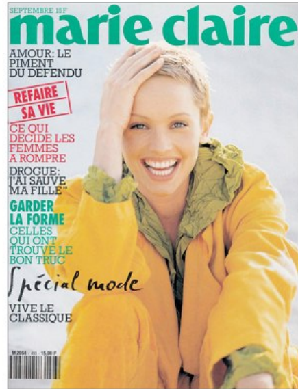
MARIE CLAIRE MAGAZINE