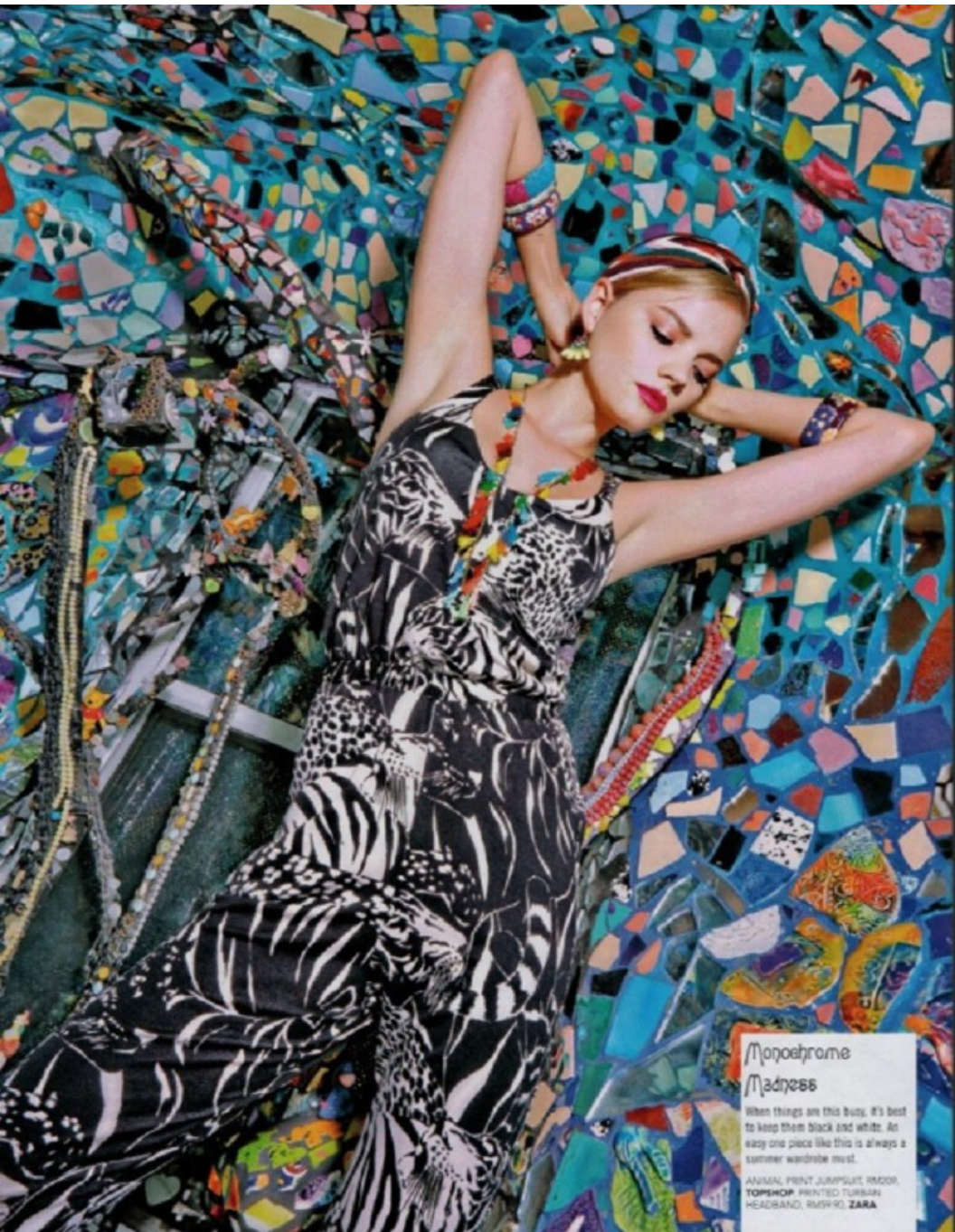
Monochrome Madress When things are this busy, it's best to keep them black and white. An easy one piece like this is always a summer wardrobe must. ANIMAL PRINT JUMPSUIT, 10400, TOPSHOP, PRINTED TURBAN, HEADBAND, 815191, ZARA.